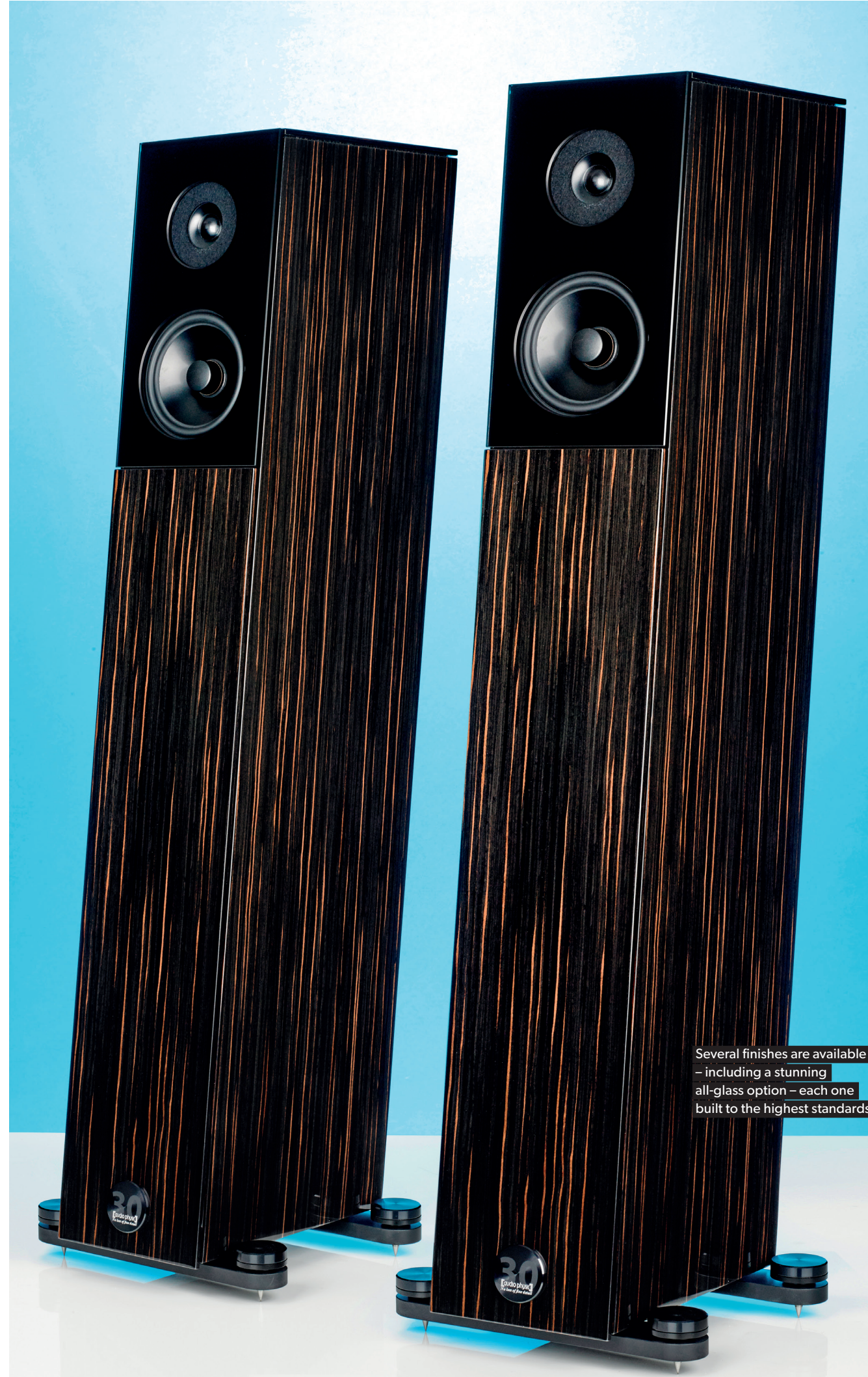
Several finishes are available - including a stunning all-glass option - each one built to the highest standards

Tonally, things are a touch brightly lit, a little lean and can be provoked with aggressive recordings or edgy systems. But if carefully matched, the presentation remains balanced enough to convince. The integration between the three drivers is seamless, which points to a carefully calibrated crossover.