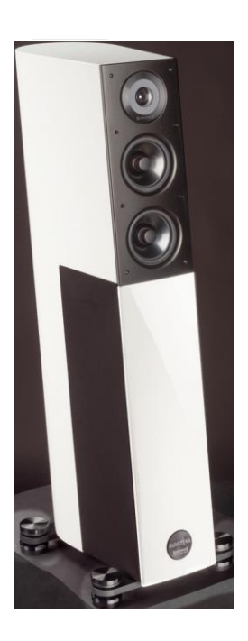
The characteristic shape of the Avantera with its 7° backward-sloping cabinet

The unique cone tweeter, also meticulously re-engineered